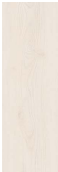
Oak Polar White