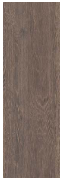
Oak Rustic Silver