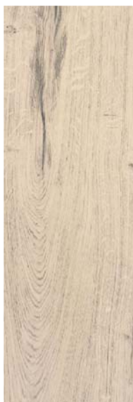
Stone Oak Limewashed