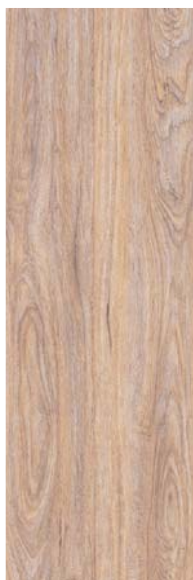
Cork Oak Leached