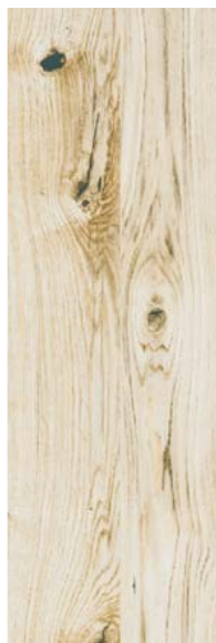
Oak Verginia White