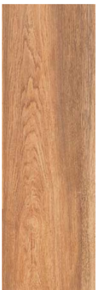
Oak Floor Board