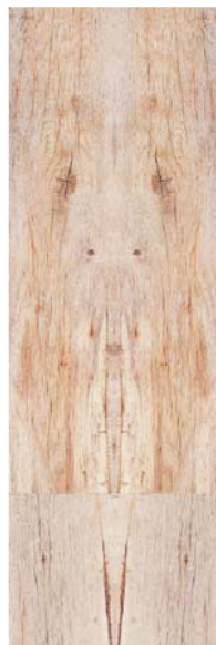
Siberian Larch Limewashed