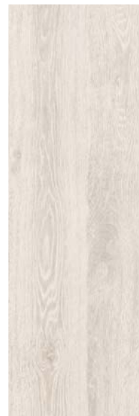
Oak Castle White