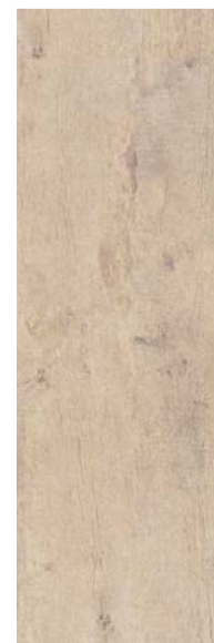
Oak Antique Washed